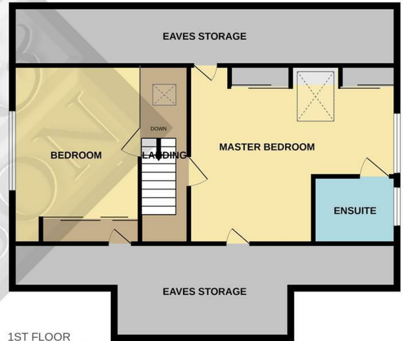
1ST FLOOR 867 sq.ft. (80.5 sq.m.) approx.

TOTAL FLOOR AREA : 2315 sq.ft. (215.1 sq.m.) approx.